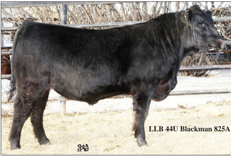
LLB 44U Blackman 825A